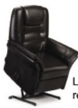
Lift and rise reclining chair

Leather and fabric suites. Corner groups. Chairs. Sofabeds. Beds/Bunkbeds. Wardrobes. Recliners. Many other items in stock for pre-Christmas delivery