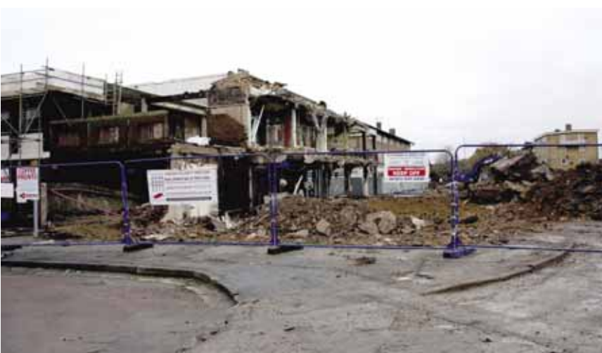
Site being cleared for Aldi Store

County Councillors have overturned a Planning Officer's recommendation to refuse permission for Aldi to build their new store in the Town Centre. The officer reported that one wall of the building was too bland, but if the Councillors had supported this view Aldi would have withdrawn and gone elsewhere.