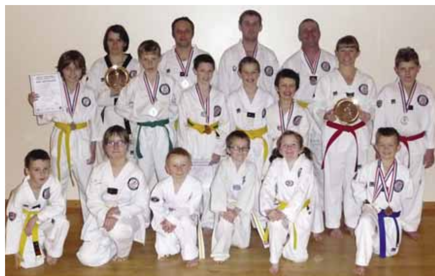
Club won 6 gold and 6 silver

Woodham Club isn't just about the gradings though, 12 students entered the 1 to 1 fight competition held also at Spennymoor Leisure Centre the week before the gradings. The standard was very high and Woodham