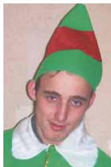
Happy 21st Birthday 12th December 2010