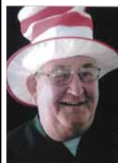
Happy 80th Birthday