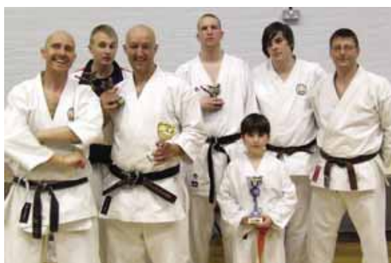
Trophy winners from Isle of Man Karate Federation Annual Competition.

Newton Aycliffe Karate Club is based at Neville Parade Community Centre and has been established for over 30 years with five Black Belt Senior Instructors, each with over 25 years of martial arts experience.