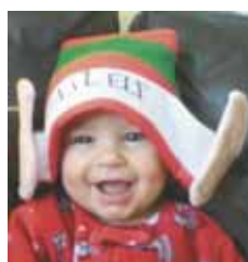
Happy 1st Birthday