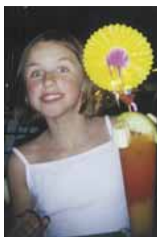
Happy 18th Birthday