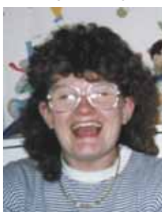
Happy 50th Birthday