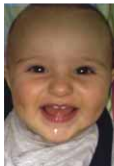
Happy 1st Birthday