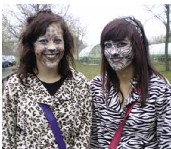
a remarkable achievement that exemplifies the fantastic commitment of our students.

day's fundraising effort. The day was a resounding success, being both fun and constructive in terms of raising money and awareness for the cause of Children in Need. Throughout the day, students were witnessed braving the cold dressed in their pyjamas, as cave people/soldiers, participating in other activities such as sponsored car washes and a charity netball game of students versus teachers. The students made a massive effort in both raising money and in their positive attitude towards the event; they were a huge credit to the College. As a result of the huge success of the Children in Need event hosted by Woodham College, the students, teachers, staff and other contributors managed to raise a very impressive, and record-breaking amount in excess of £1800. This is