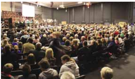
Last year's audience at Xcel Centre

Don't miss Newton Aycliffe's annual Community Christmas Singalong at the Xcel Centre this Sunday 12th December from 3pm till 4.30pm.