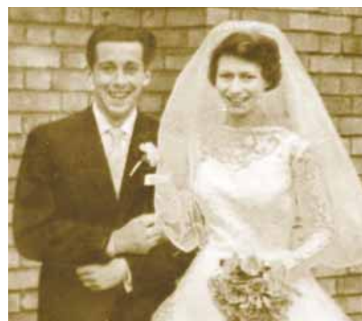
Golden Wedding Anniversary