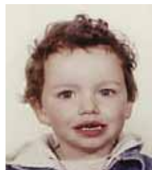
Happy 18th Birthday