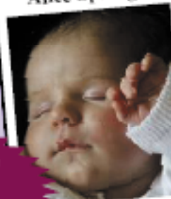
Happy 21st Birthday