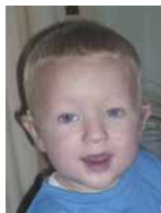
Happy 2nd Birthday