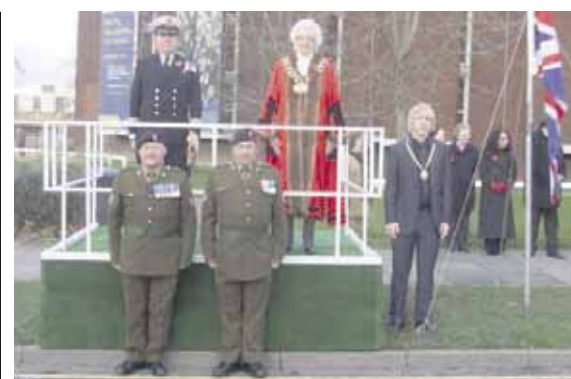
The Mayor and the Reviewing Officer take the salute at the March Past after the Remembrance Sunday Service