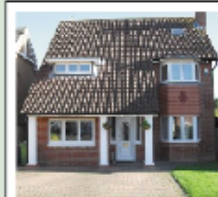
Karles Close Newton Aycliffe

Four Bedroom, Three Bathroom, Extended and Decorated to a very high standard. Early viewing is recommended as this property will not be on the market for long.