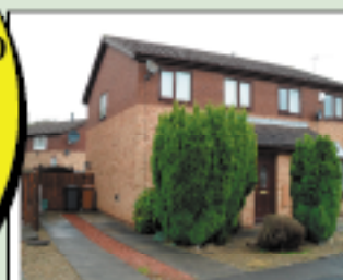
Pemberton Road Newton Aycliffe

If you have a property that has never been rented before, you are now required to hold an Energy Certificate (EPC) before marketing. Move On Homes are offering FREE EPC's to Landlords, on either our letting only or full management services. Professional residential management by Chartered Surveyor and experienced staff. Call for a FREE rental valuation and appraisal.