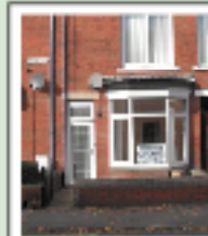
Durham Road Spennymoor

One Bedroom Ground Floor Flat. Recently Refurbished and Decorated. Immediate Vacant Possession.