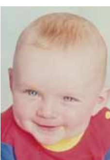
Happy 18th Birthday