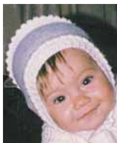
Happy 21st Birthday 8th October