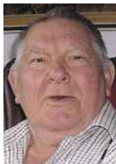
Happy 79th Birthday 13th October