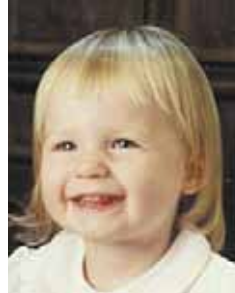
Happy 13th Birthday Princess