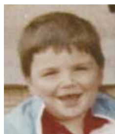
Happy 30th Birthday Babe