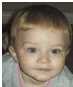
Happy Birthday Baby Boy!

Hope you have the best first birthday and boy could wish for! All our love always, Mammy and Daddy xxx