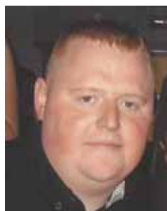
Happy 21st Birthday