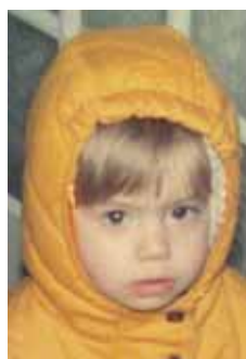
Happy 21st Birthday

21 eh?!? You are getting on a bit now! Hope you like the photo haha! I hope you have an amazing day, Babe. Love you always, Will xxxxxxxx