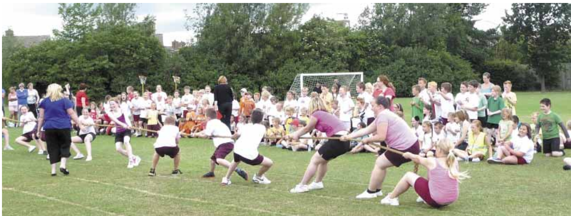
Sugar Hill School Sports Day was held on Friday 9 July 2010 in dry weather. The Junior and Infant schools were divided into teams, wearing brightly coloured T shirts to represent which colour council they were part of and the yellow team won the School Cup.