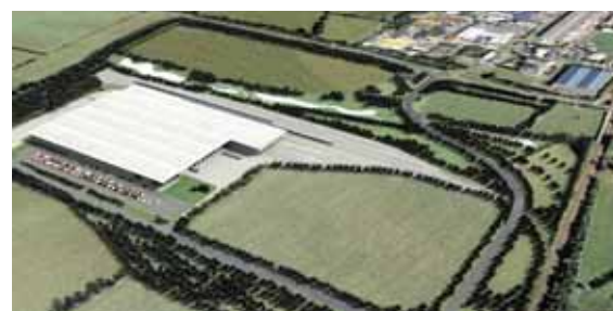
Aerial view of factory and link to Railway

which Phil Wilson intends to present to Parliament. The petition on Page 7 can be signed and handed in at Phil Wilson's office in the town centre, Newsforce and Walkers Butchers at Simpasturegate. Any other business or shop who would like to take part in the campaign please contact Phil Wilson's office on 321603.