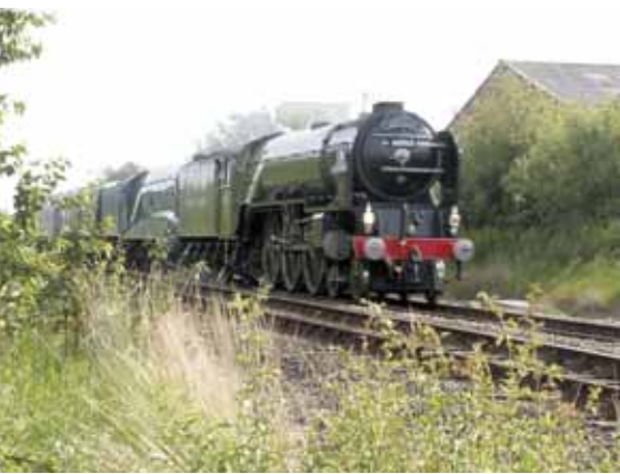
Town Councillor and amateur photographer, Bill Curtis, took this shot of the Tornado pulling Mallard to Shildon Locomotion Museum recently. Both trains are now on display drawing enthusiasts from all over the country. This shot was taken on Preston Road near the Flymo factory.