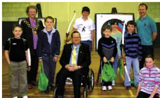
Activity Day 9th April