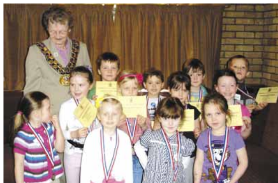
Mini Activity Session 14th April