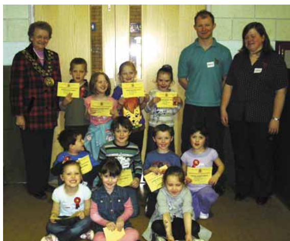
Mini Activity Session 7th April