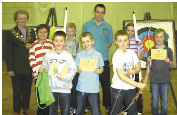
Archery 9th April