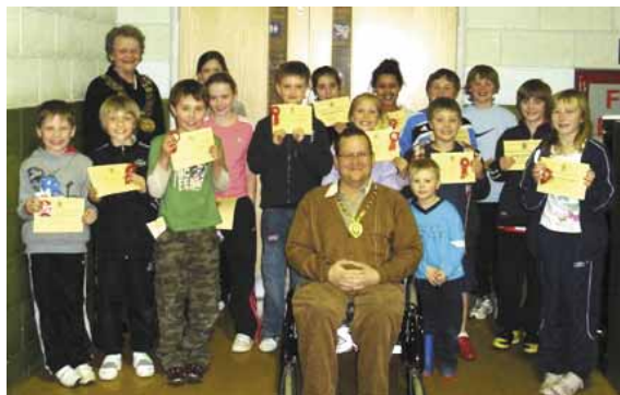
Activity Day 6th April