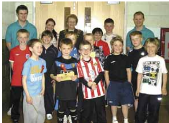
Activity Day 13th April