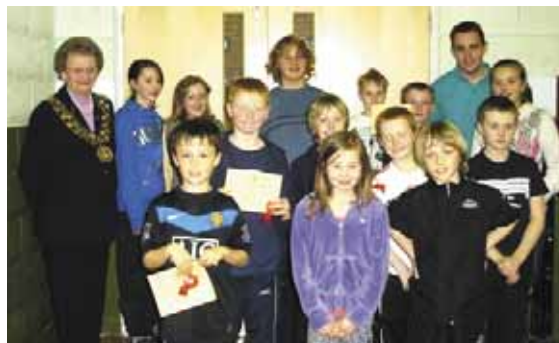
Activity Day 8th April