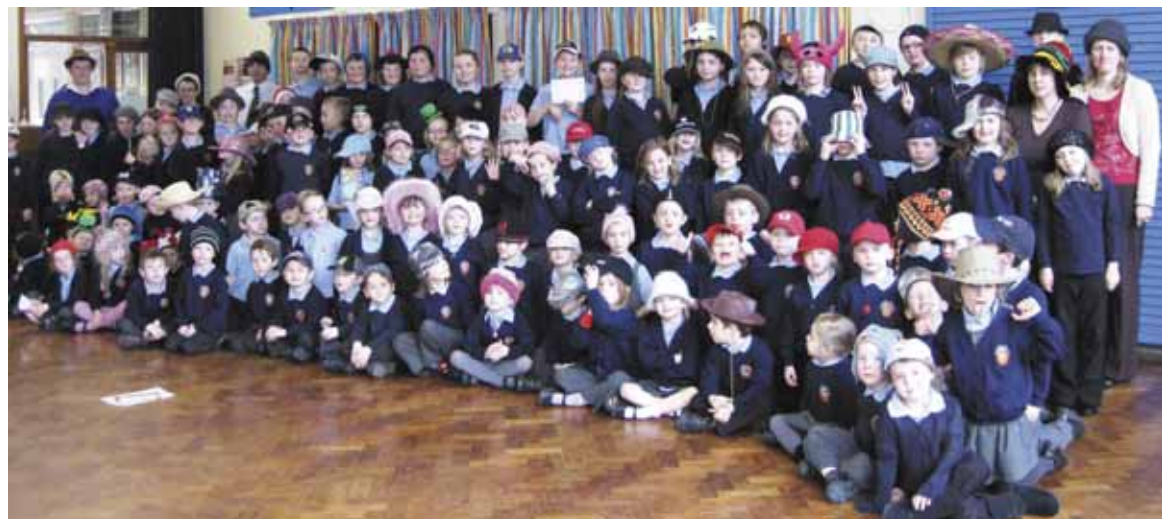
The pupils and staff at Aycliffe Village Primary School raised £217.00 for the Haiti Disaster Appeal. Everyone joined in the event by wearing a hat for the day. Thank you to all who contributed.