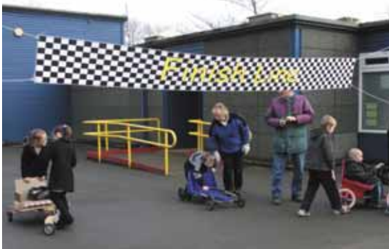
The children in Year 2 at Stephenson Way School have spent this half term building

Go Karts. They found this a very interesting part of their curriculum and have involved parents in the construction work.