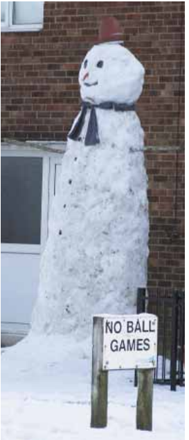
Spotted in Carr Place by a reader who asks if this is the tallest snowman in Newton Aycliffe?