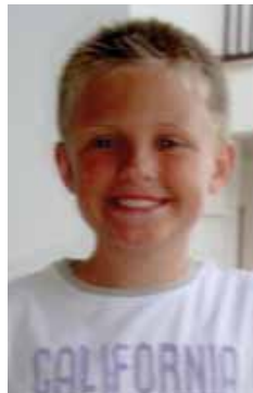
Happy 10th Birthday 31st December 2011 Lots of love, Mam, Dad and family xxxx