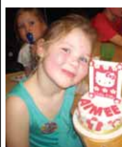
Happy 7th Birthday Princess