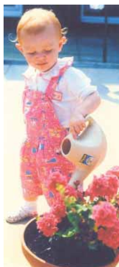
Happy 18th Birthday 26th December 2011 To a special Granddaughter. All our love today and always. Grandma and Grandad S xoxoxoxo