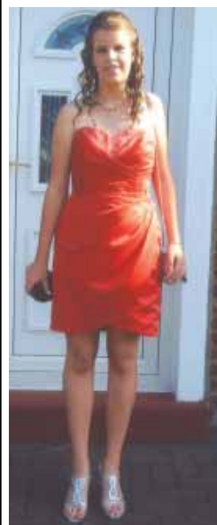
Happy 18th Birthday 21st December 2011