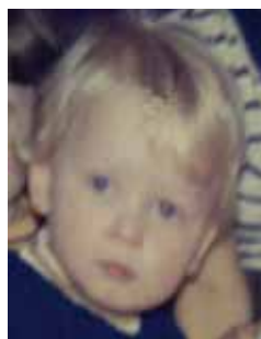
THE BIG 4-0 23rd December