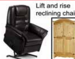
Lift and rise reclining chair

Fulbeck Road, Aycliffe Business Park - 07825 777 966