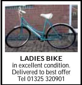
LADIES BIKE in excellent condition. Delivered to best offer Tel 01325 320901