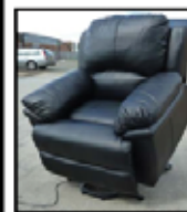
Lift and rise reclining chair