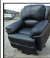
Lift and rise reclining chair

Fulbeck Road, Aycliffe Industrial Park - 07825 777966