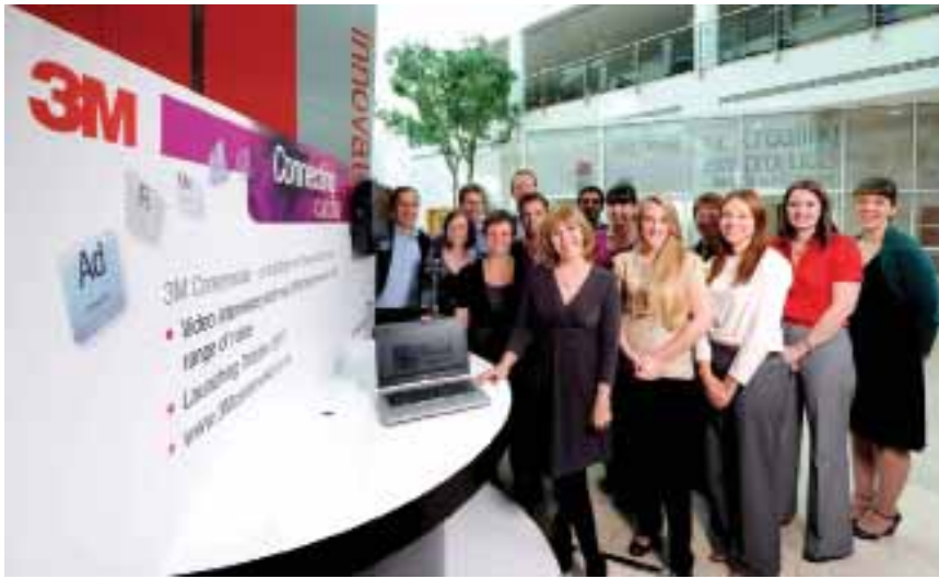
Employees at 3M's Aycliffe

site are sharing their career experiences online to give school students a personal insight into the world of work. The diversified technology company has devised a free online resource for secondary schools. 3M Careerwise (www.3mcareerwise.co.uk) is aimed primarily at students aged 11-14 – particularly those who are considering their choice of GCSE subjects.