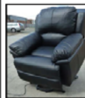
Lift and rise reclining chair