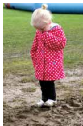
Having a splodge

The Junior football Competition was as successful as ever - the condition of the pitch having no effect on the enthusiasm of the youngsters. Nor was there any lack of zeal from the numerous displays and entertainment around the showground including the ever popular Punch & Judy. All in all a great effort by the Town Council for a great Show - proving that despite bad weather the townsfolk will always turn out to support this annual event. (More photos of Show inside)