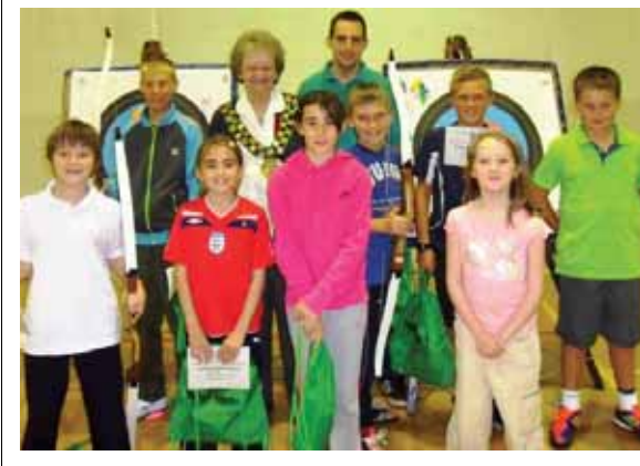
The Sports Courses at the Oak Leaf organised by the Town Council have been very popular with children who have learnt new skills and been introduced to different sporting activities including bowls, badminton, and archery