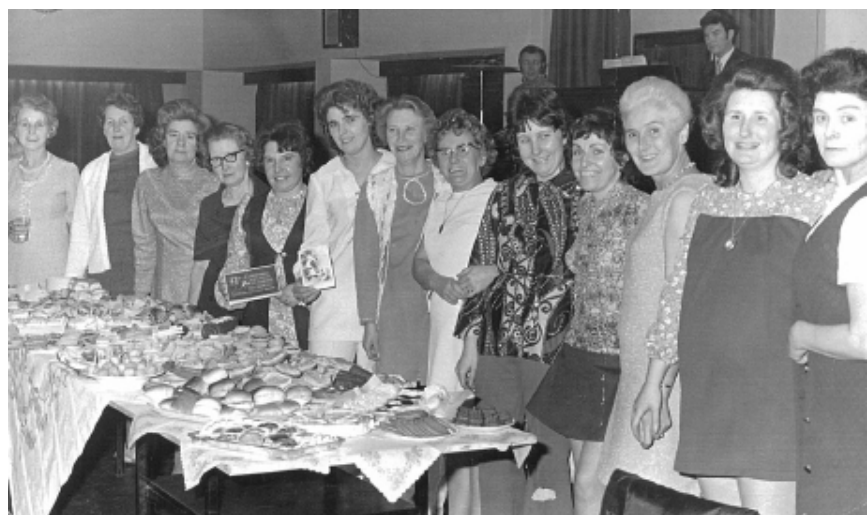
Photos taken at a Ladies Night at the Southerne Club 46 years ago. It should bring back memories for those who attended the Wednesday night ladies session where they met socially to learn to dance and have a good old chat. If any reader has similar photos of times gone by Newton News would be happy to publish them.