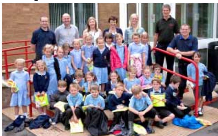
Pupils and staff from Aycliffe Village School with members of the 3M Environment Team