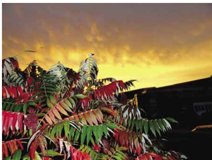
Tim Roberts captured some beautiful colours in this sunset photograph