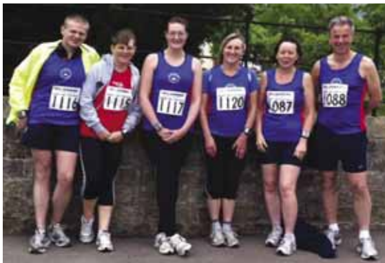
Team Aycliffe getting ready for Raby Castle 5k