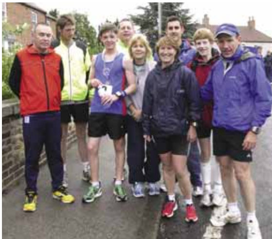
Team Aycliffe at Melmerby 10k

course and ideal for any budding runners. There will be £100 for the first male and female runners along with veteran prizes. Everyone that finishes the race will receive a technical running shirt. If the 10k isn't your thing then why not take part in the increasingly popular 3k fun run. It's ideal for running with the kids and will help to keep them entertained. Every year it's proving more and more popular and is a real family event. If you're interested in taking part in either the 10k or the 3k fun run, information can be found on our website http://www.ayclifferrunningclub.org.uk/