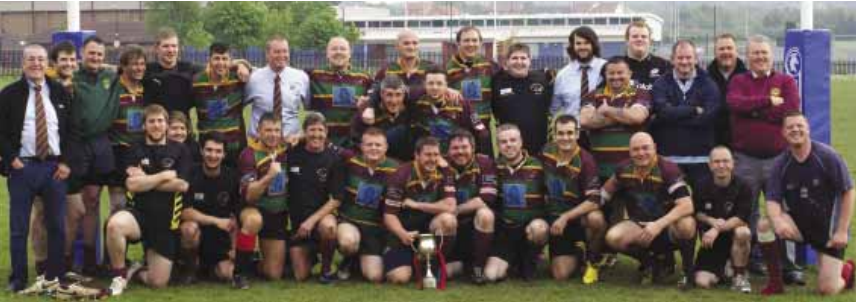
Newton Aycliffe 18 v South Tyneside College 15