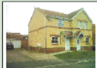
KESTREL COURT Newton Aycliffe £99,950

Three bedroom end terrace house, ideal for the growing family. Kitchen/Dining Room and Lounge, GCH and Double Glazed, Gardens, close to school and bus routes