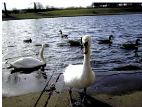
Swans on West Lake