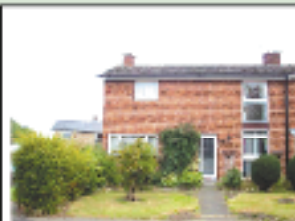
WOLSEY CLOSE Newton Aycliffe Guide Price £89,950

Two bedroom detached bungalow in a popular part of Woodham, GCH, UPVC Double Glazing, Lounge/Dining Room, Fitted Kitchen, Gardens from and rear, drive and garage