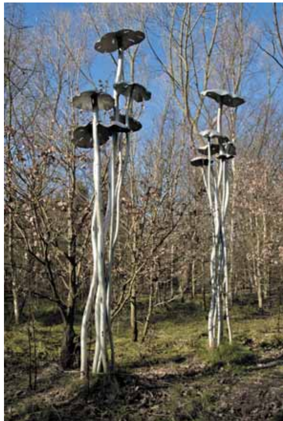
Pretty picture of sculptures on Great Aycliffe Way