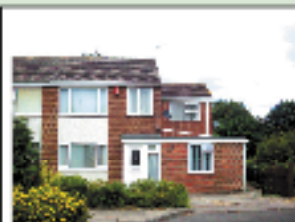
RUSSELL COURT Newton Aycliffe £142,995

One bedroom ground floor flat, ideal for FTH or couple, excellent refitted Kitchen and Lounge, GCH and UPVC Double glazing. New carpets, decor and hot water tank, garden areas