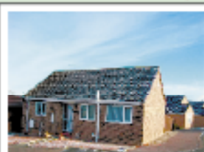
SANDOWN DRIVE Woodham Village £164,995

Benefits of an Alison Dyson Auction: 0% Commission on all sales Security of a non-refundable deposit A fixed date for exchange/completion Achieve true market value