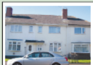
HUNDENS LANE Darlington Startin Bid £40,000

Immaculate five bedroom semi detached house, ideal for the growing family. Kitchen, Sun Room, Lounge and Dining Room, GCH, DG, guest bedroom and Shower room, garden, patio