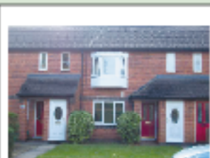
GREGORY COURT Newton Aycliffe £73,950

Two bedroom semi detached house, modern development in Newton Aycliffe, lounge and fitted kitchen, D/Glazing, G.C.H., garden front and rear, drive, detached garage, no chain