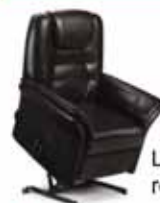
Lift and rise reclining chair