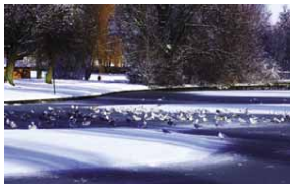
Birds on West Park Lake by Brian Geddes