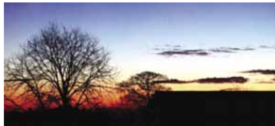
Beautiful Sunset caught by Jonathon Bridgwater at Guthrum Place.