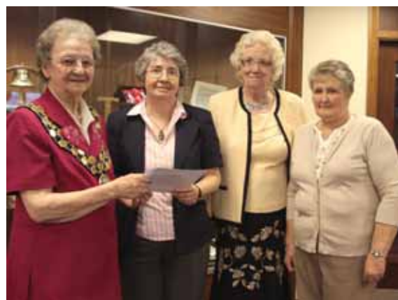
Newton Aycliffe New Faces, New Places Club