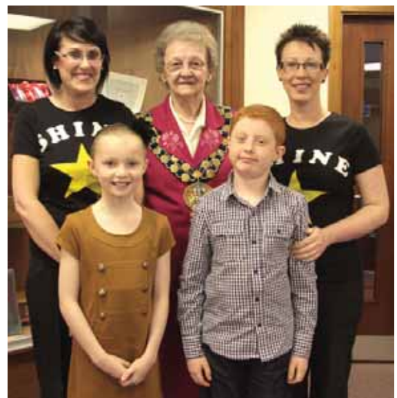
Newton Aycliffe Children's Community Choir