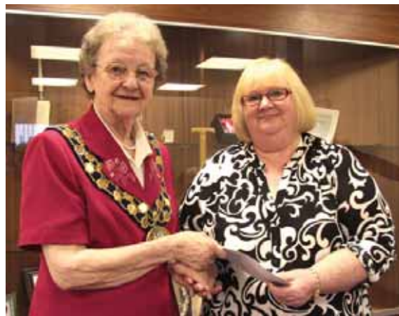
Newton Aycliffe MIND