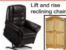
Lift and rise reclining chair

Fulbeck Road, Aycliffe Business Park – 07825 777 966