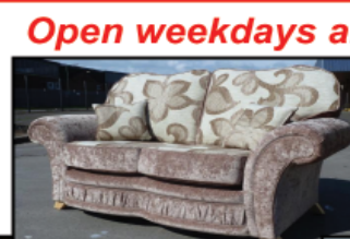
Leather and fabric sofas. Recliner sofas Beds and Bunks. Wardrobes. Many other items in stock.