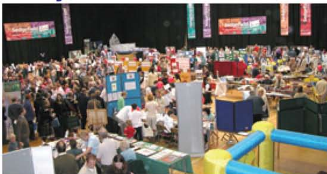
The Leisure Centre's main hall, the venue for the very successful Community Fair organised by the Rotary Club of Newton Aycliffe