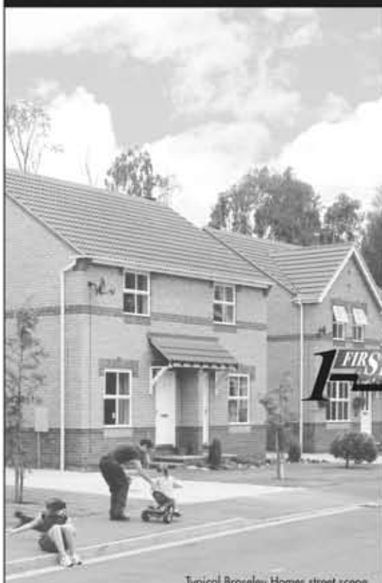
Typical Broseley Homes street scene