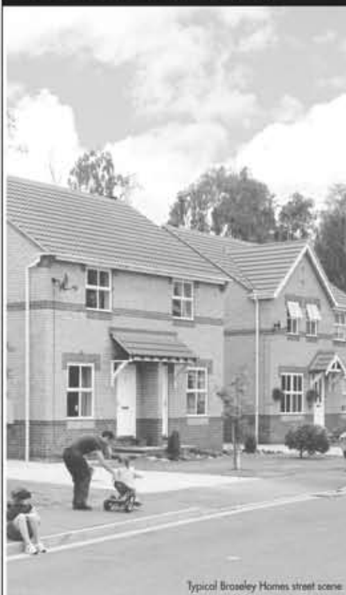
Typical Broseley Homes street scene