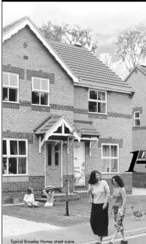
Typical Broseley Homes street scene