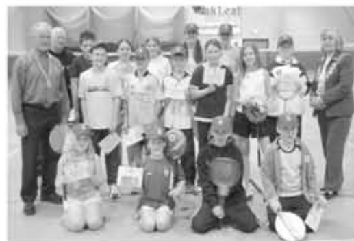
The above photos are of the children who took part in the Squash, Badminton and Golf Super Sports Skills coaching courses held over the Half Term holiday at the Oak Leaf Sports Complex.