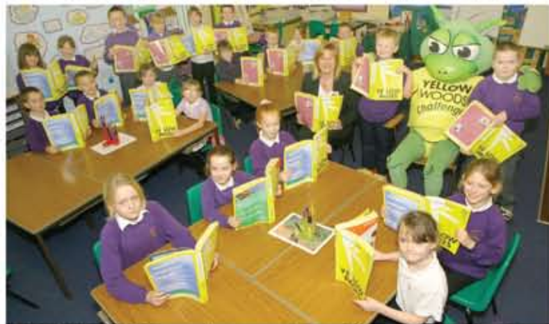
BUG ALERT - Kirk the recycling mascot, visits pupils at Stephenson Way Primary School, Newton Aycliffe to boost the yellow pages appeal