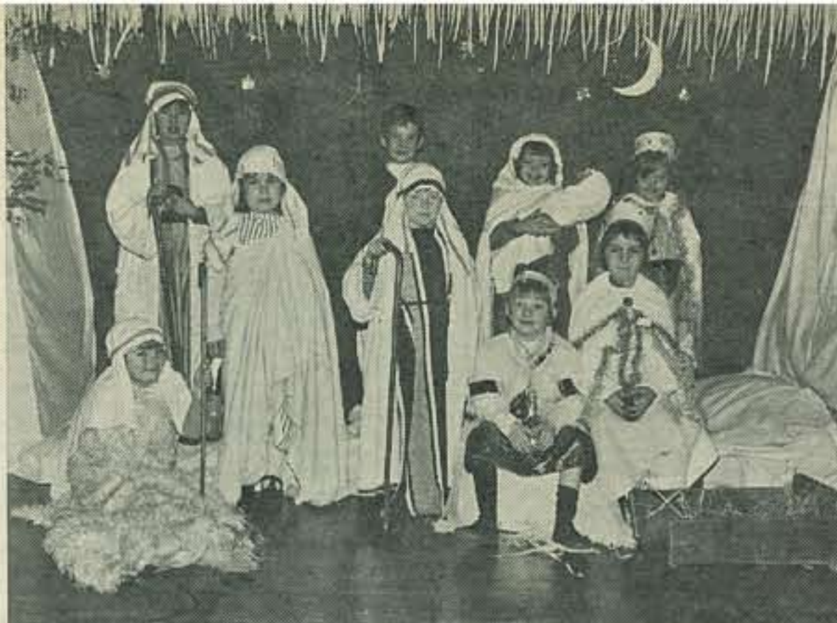
Children from Vane Road Infants School pictured during the Nativity scene from the Carol Service held recently.