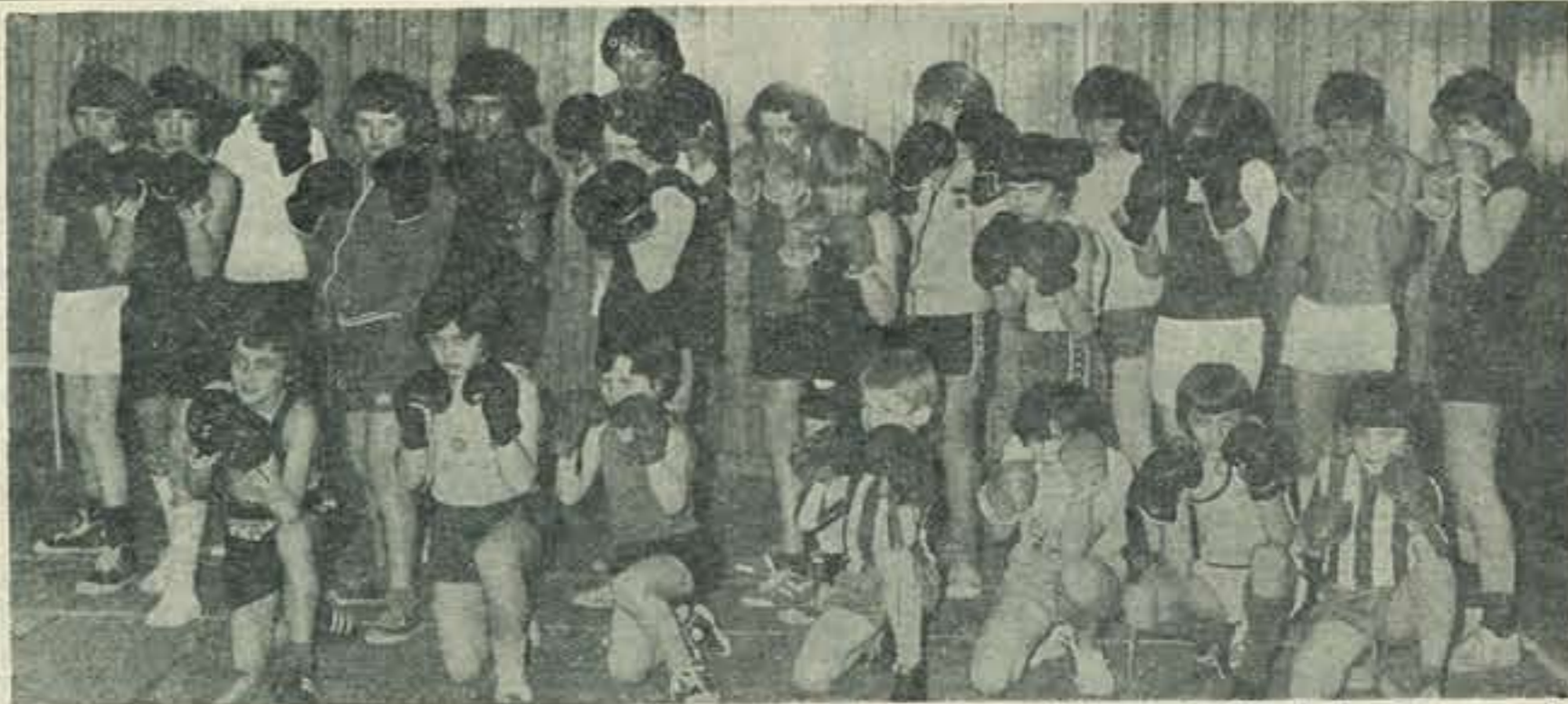
Junior members of Newton Aycliffe Boxing Club pose for the camera before commencing training. New members are always welcome, just go along to the Youth Centre at 6 p.m. Friday evenings.