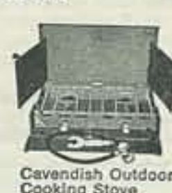
Cavendish Outdoor Cooking Stove