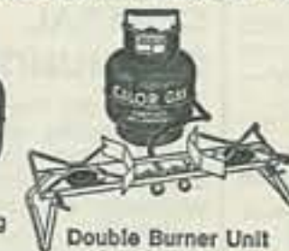
Double Burner Unit