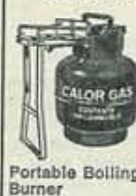
Portable Boiling Burner

Choose from today's most advanced outdoor gas appliances. Luxury gas living outdoors! Whether it's for camping or picnics, always take advantage of Super Calor—the go-anywhere gas that runs a wide range of up-to-date outdoor cooking stoves. For full details, call and see us: