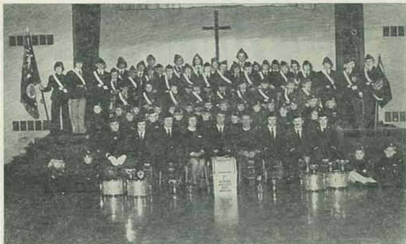
Newton Aycliffe Boys Brigade at their Enrolment and Open Night held recently.