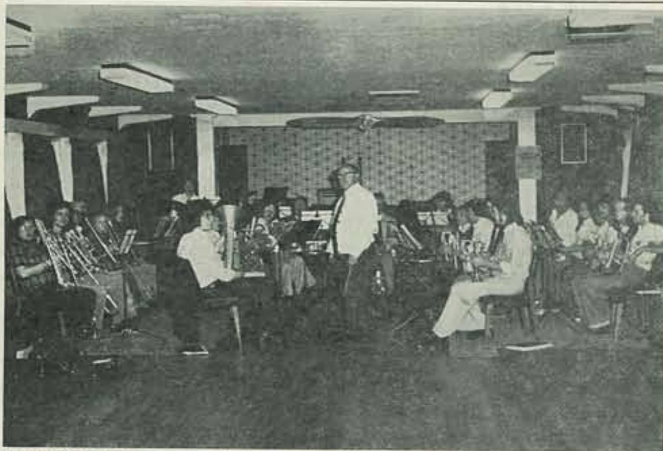
N/Aycliffe Town Band relax during practise after winning the Brass Band competition to celebrate the 150th Anniversary of the Stockton and Darlington Railway.