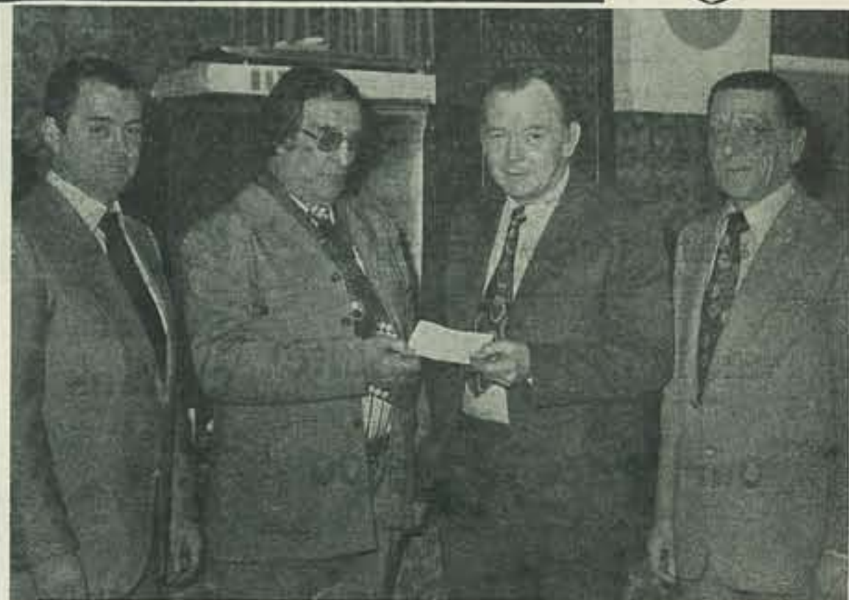
2 cheques for £25 were presented by RBL stewards and licencees at a buffet dance to the Handicapped Pool fund & the Ex-Servicemens Assoc.