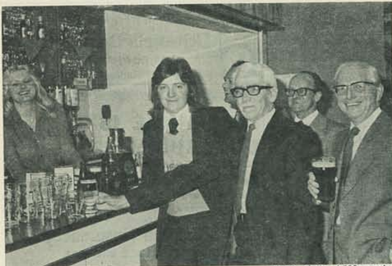
Some of the 1,000 members of the newly opened Eaton Sports and Social club, sampling the beer. The club also has changing room and shower facilities.