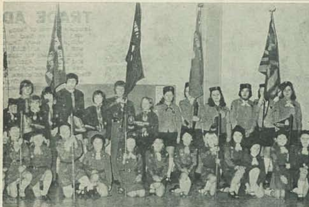
Our photograph shows Guides and Scouts at the Thinking Day on February 23rd.