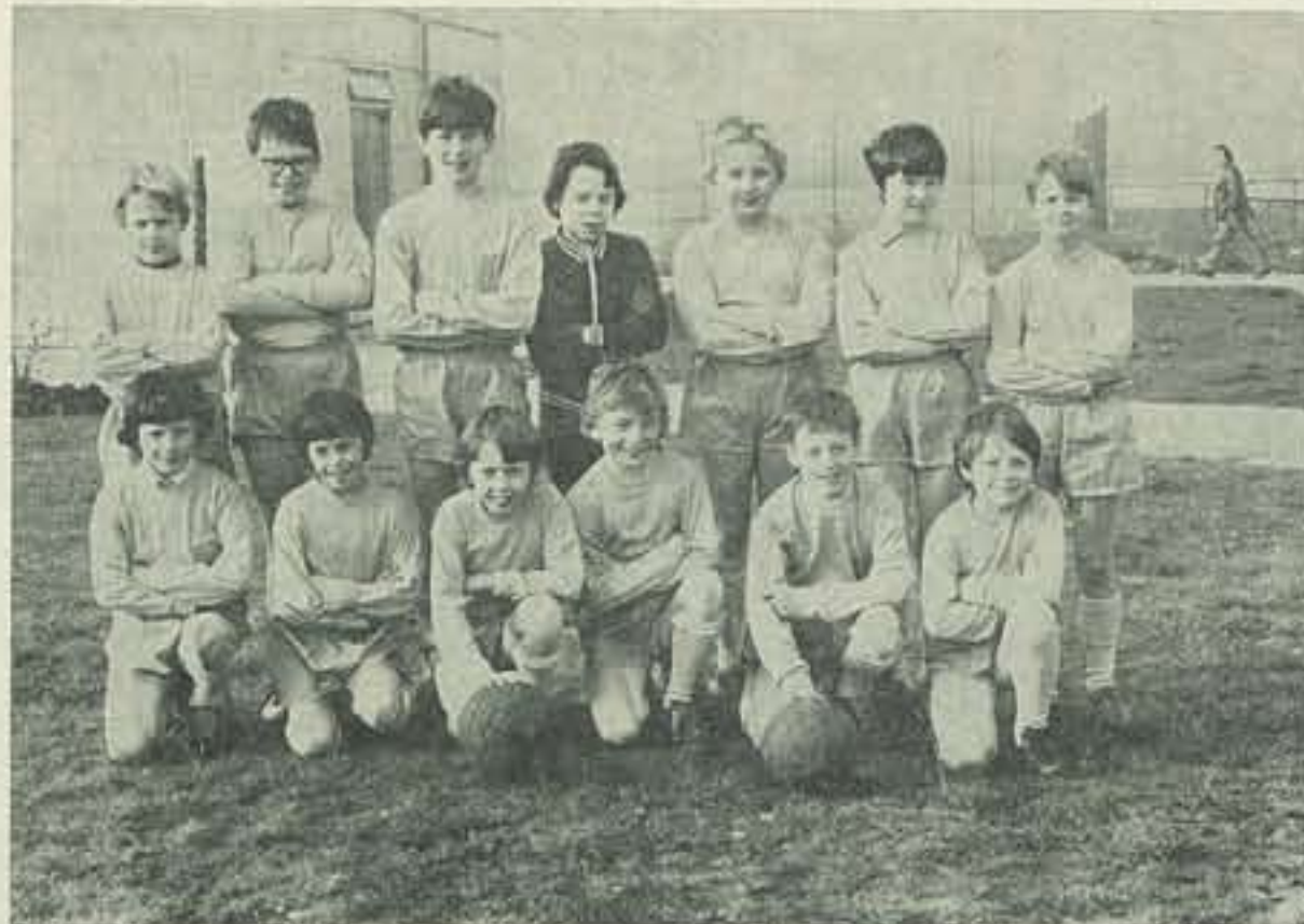
Newton Aycliffe Boys Brigade football team who won the Boy Brigade Cup by beating Darlington BB last Saturday.