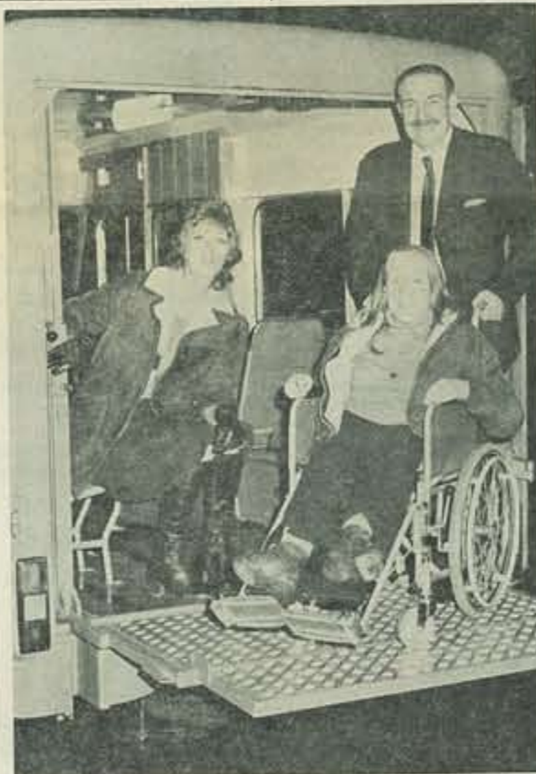
The Physically Handicapped Club received their new Mini Bus with automatic lift recently. The bus was bought from donations.