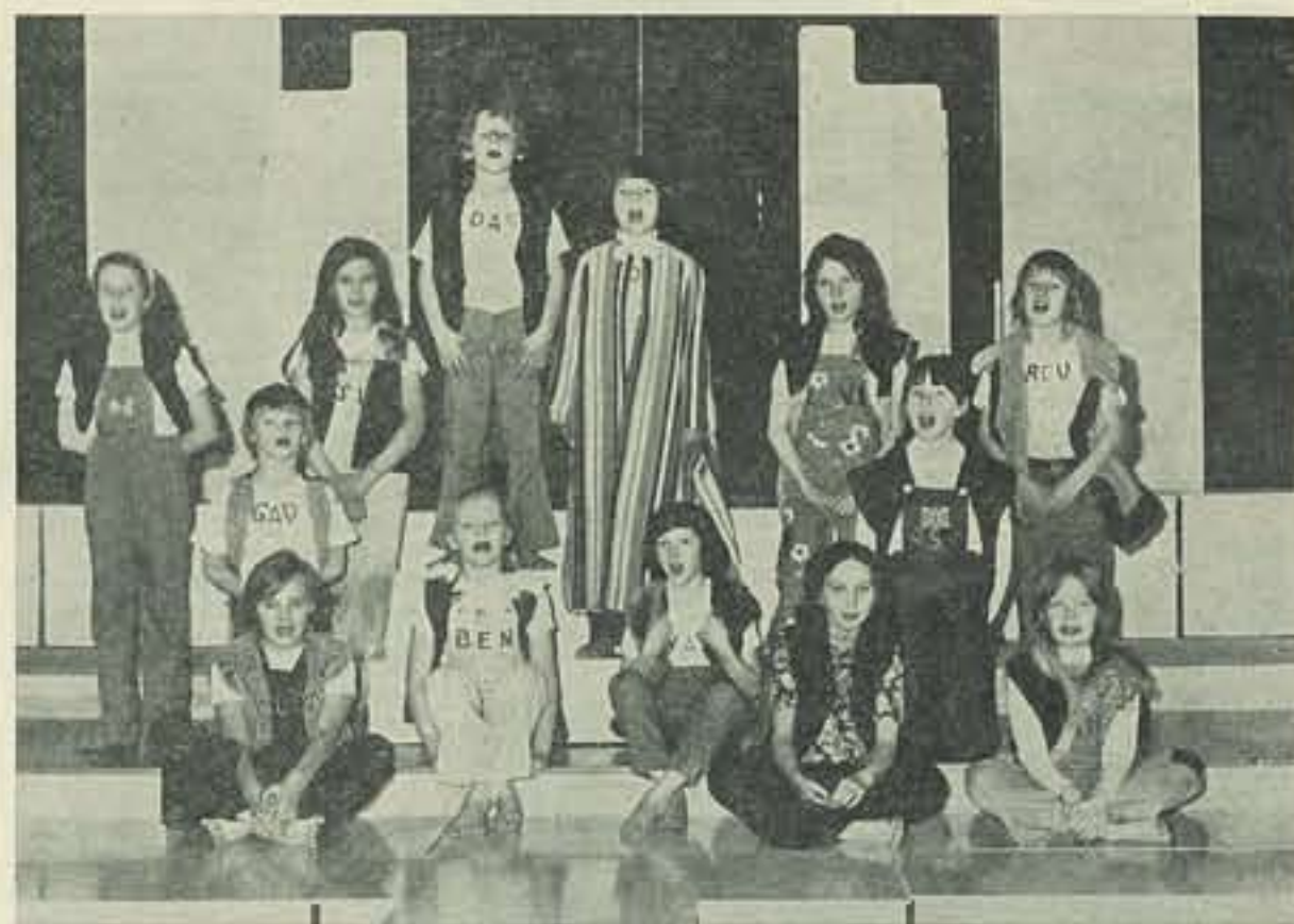
Some of the 123 children of St Josephs School who took part in their own production of "Joseph and his Technicolour Dream Cote" held in the school this past week.

Items for the Sale would be appreciated and collection arranged by ringing Aycliffe 3613 — Thankyou