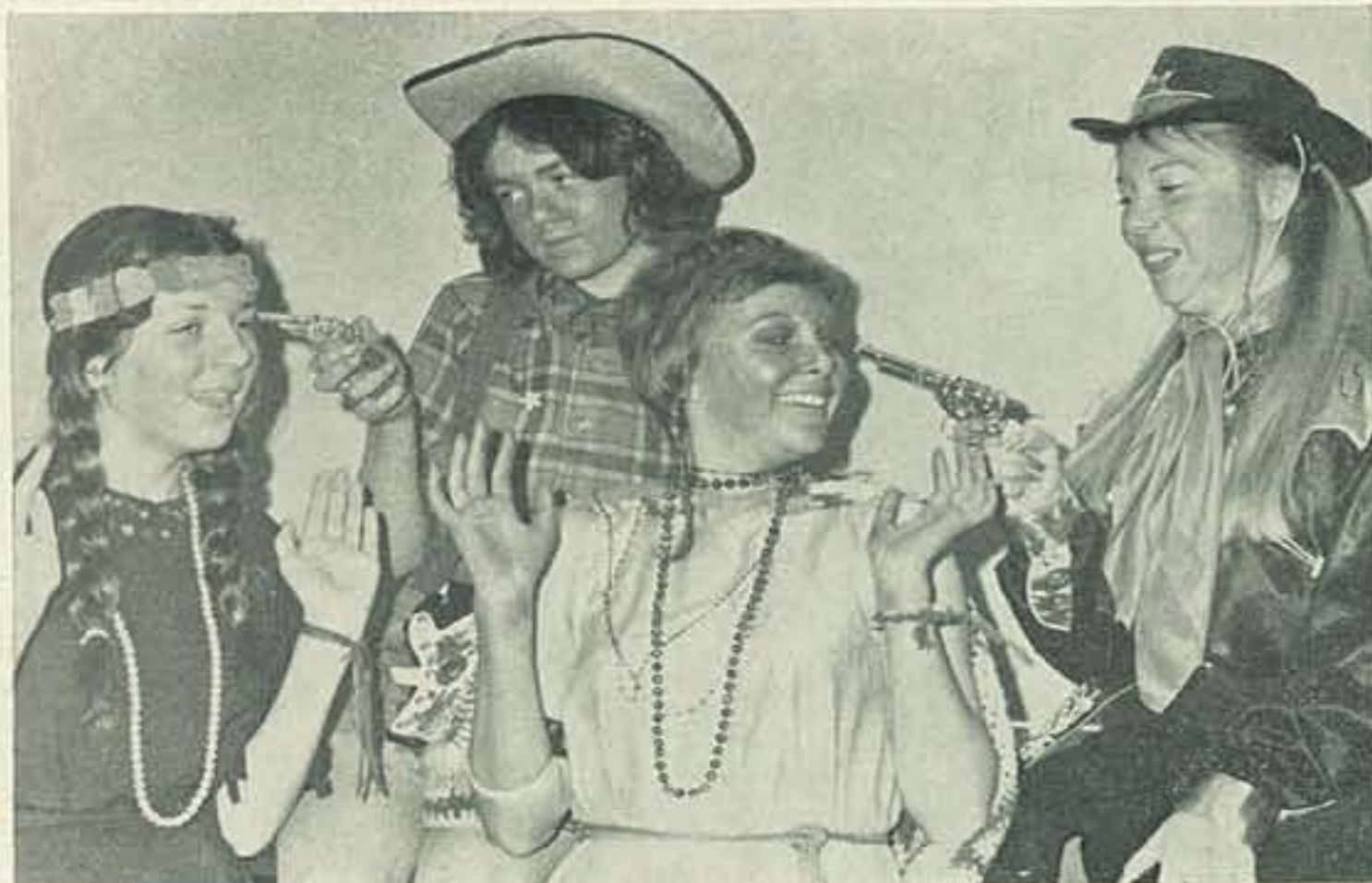
Members of Newton Aycliffe Youth Centre "Shooting it up" at their recently held "Wild West Night".