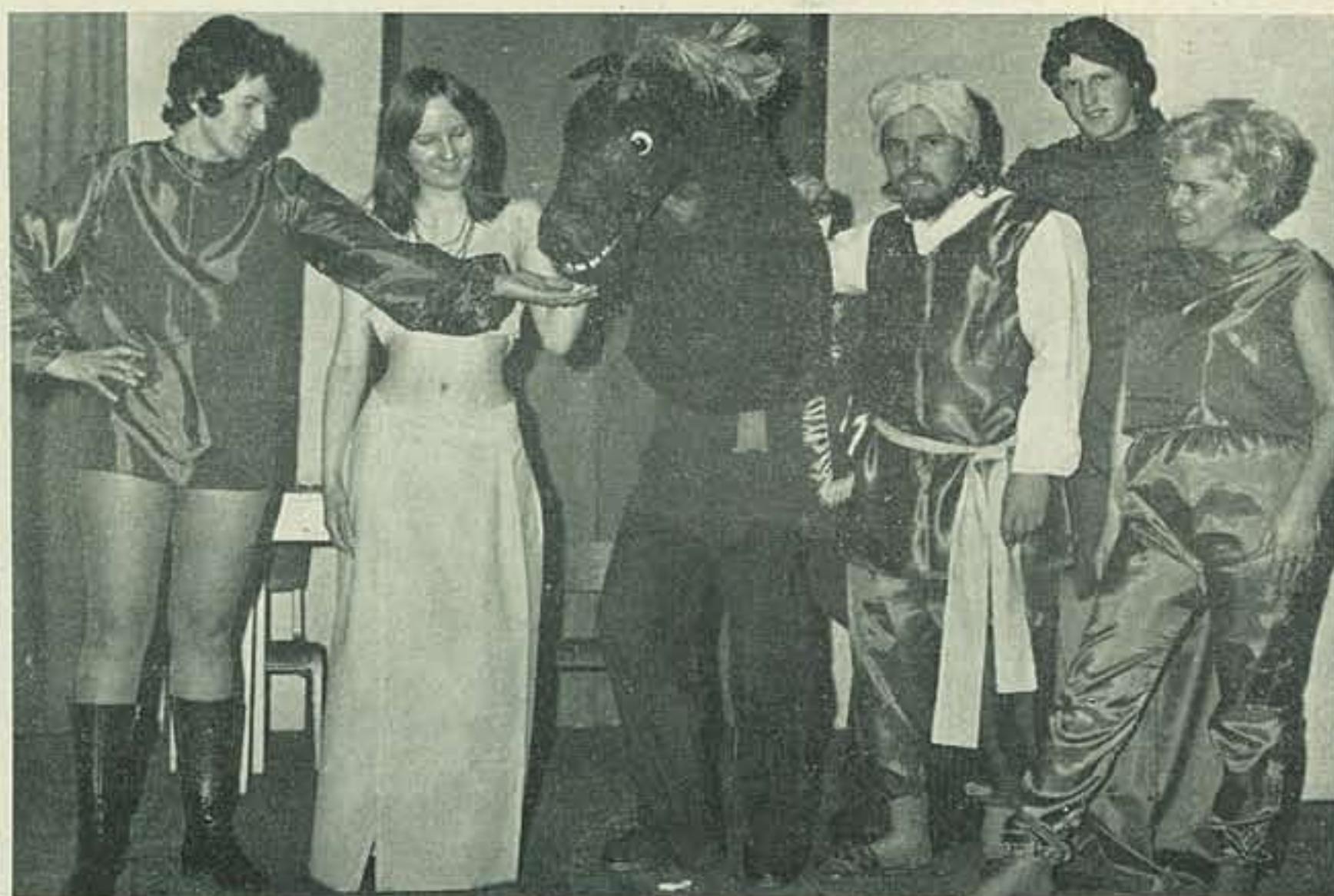
The "TALKING HORSE" receiving attention from part of the cast of the Newton Players production ALI BABA