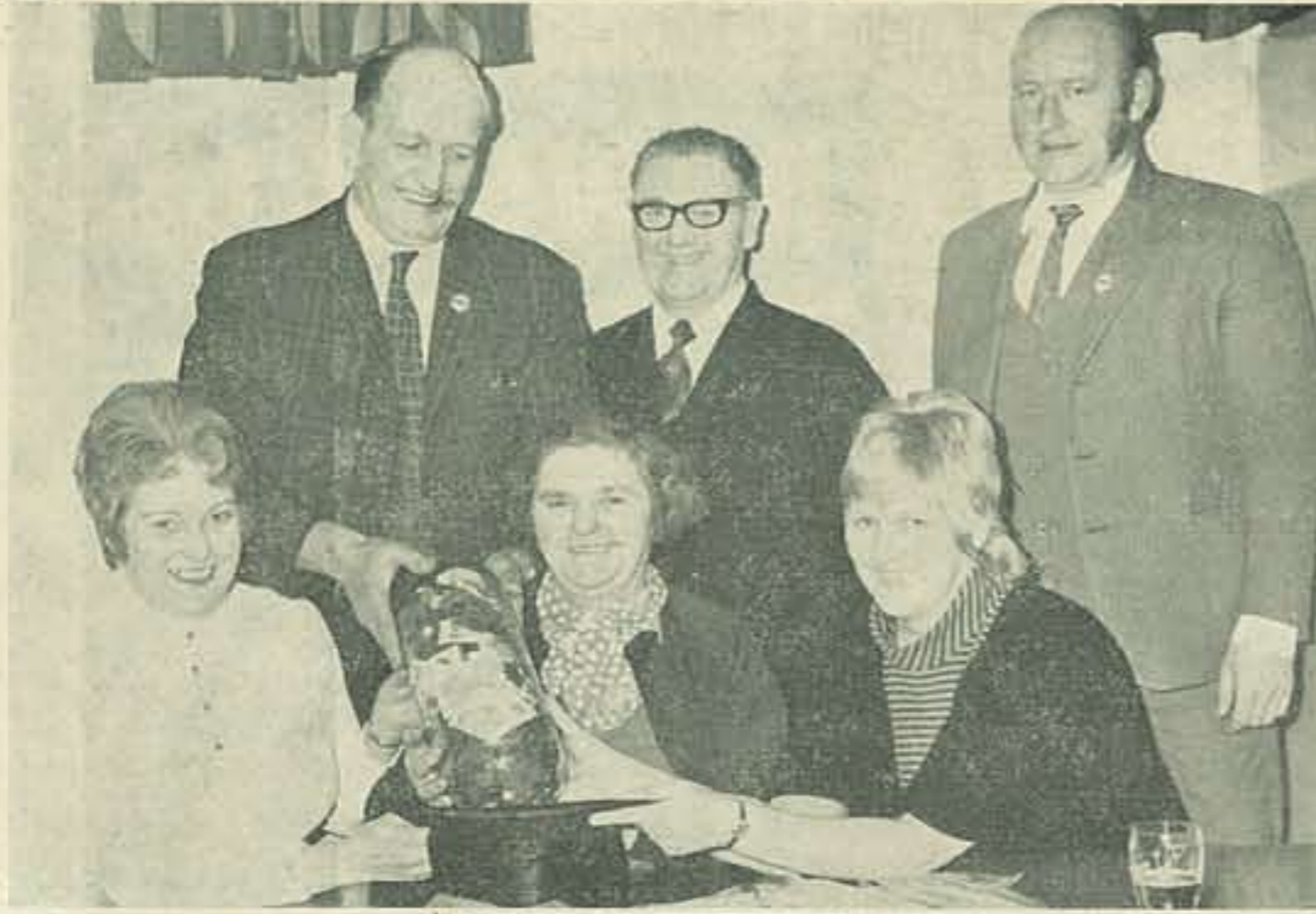
Ladies Section of the Labour and Trades Club empty the bottle which raised £93.07½ for the old peoples dinner.