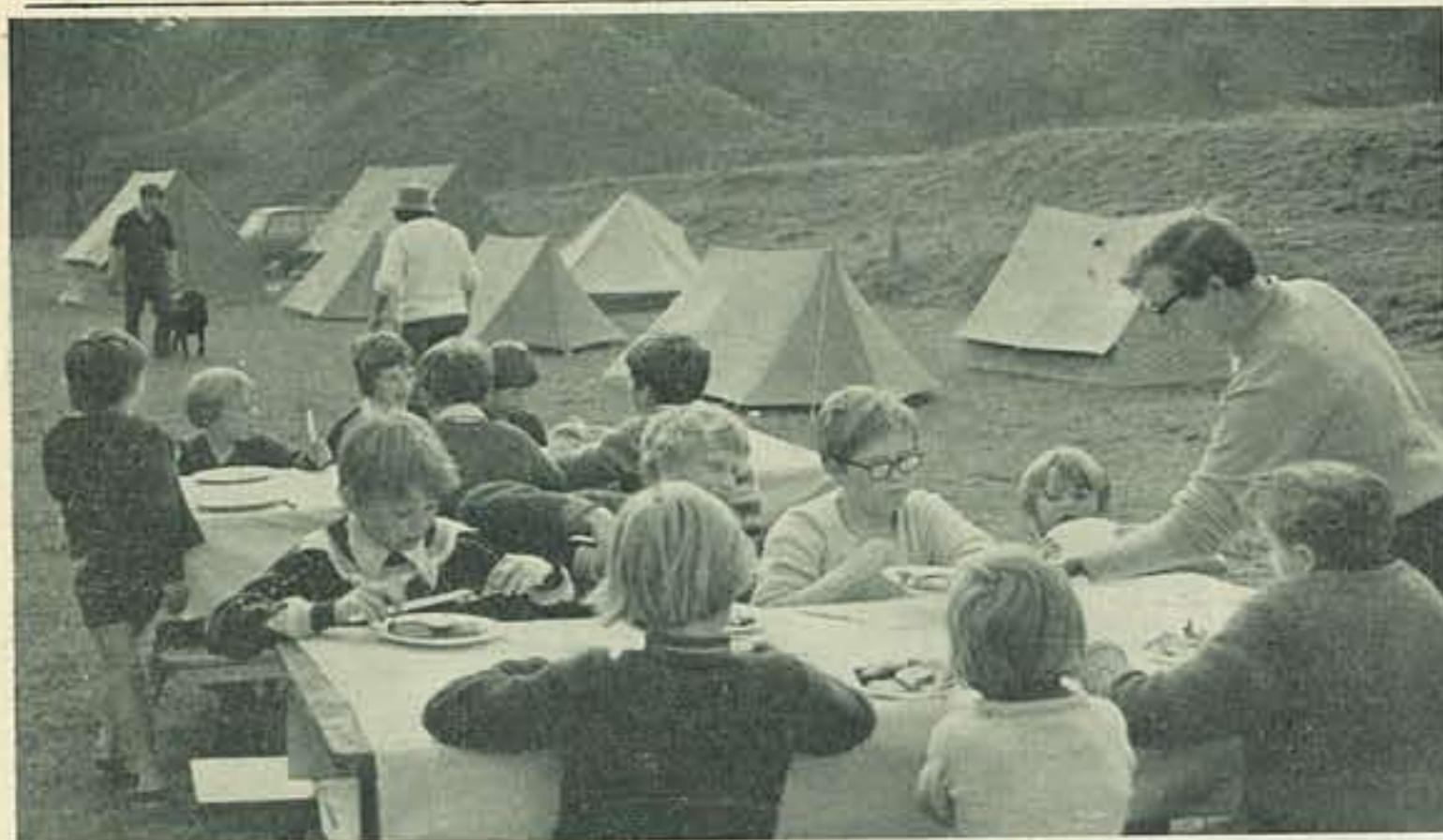
"Breakfast is served" at the Camping Weekend organised by Round Table and Parish Council