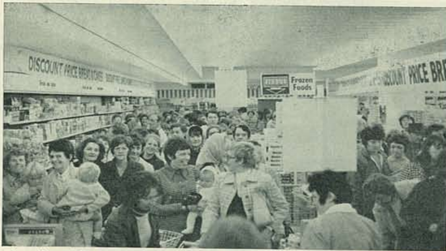
A section of the new Law's Store showing Newtonians eagerly bargain hunting.