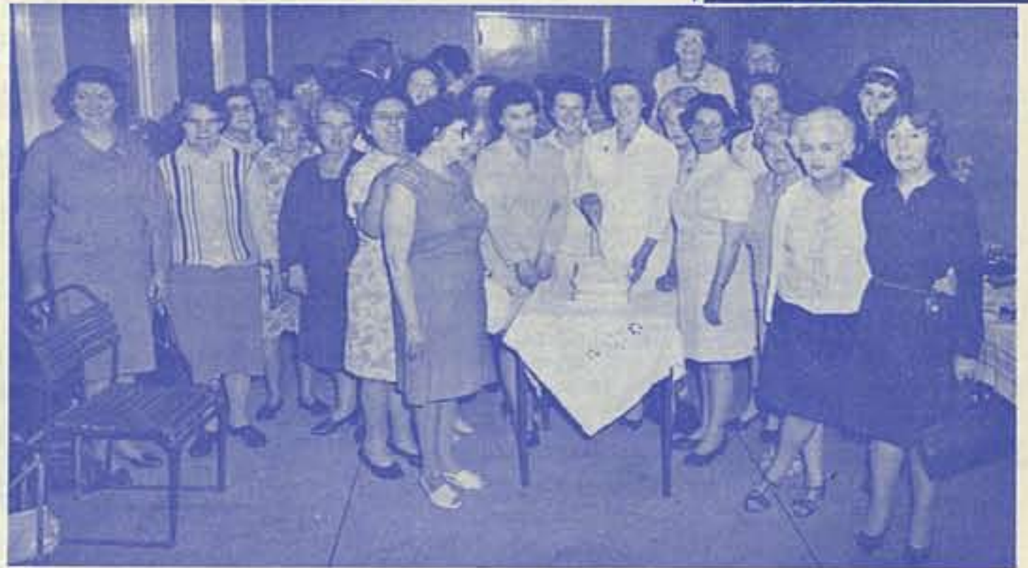
Co-Operative Womens Guild