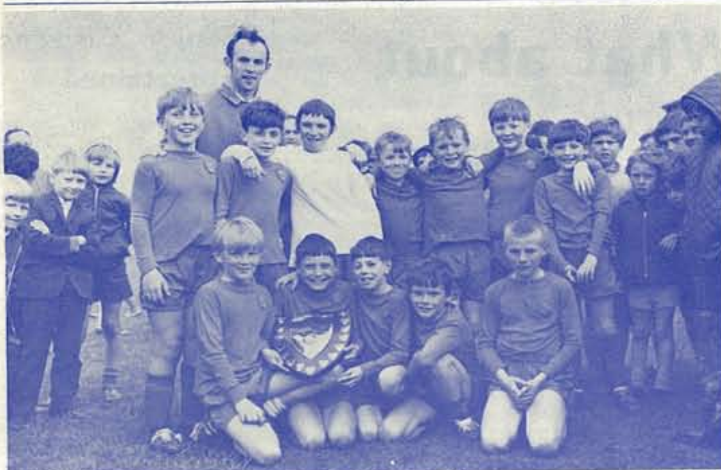
Finalists in the Parish Council School Football competition Vane Road and Woodham Burn. The match was played at St. Mary's ground. Both teams played hard, exciting football, but Woodham Burn managed to win the match and the Shield by 2 goals to 1.