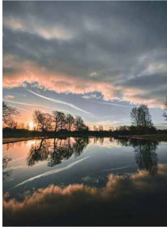
West Park Lake by Lynn Shaw