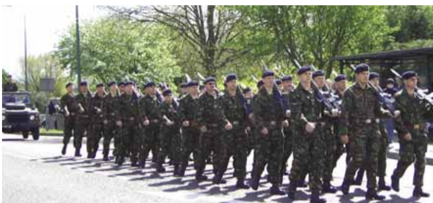
Photo from the 2005 Parade