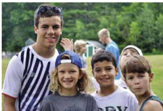
from Anderson Sports